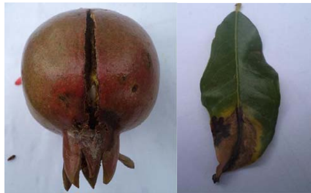
FIG. 1 BACTERIAL BLIGHT ON POMEGRANATE FRUIT AND LEAF

Automatic fruit disease detection system takes the input image and show the results directly to the farmer. But if the image taken by farmer having the poor quality in that case the results shown by the system may not be accurate. So we are adding Intent search technique into the system and will help to find the user intension of disease search. It will also help increase the accuracy of the system.